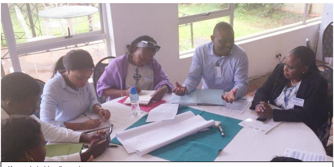
Key stakeholder discussion group