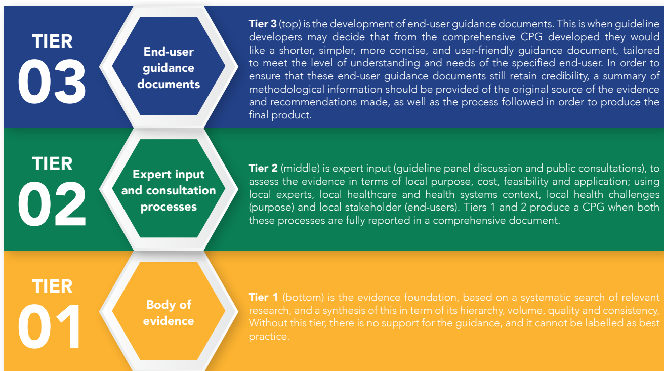
Figure 2: The conceptual framework to efficiently develop credible CPGs for use in resource-poor countries such as South Africa