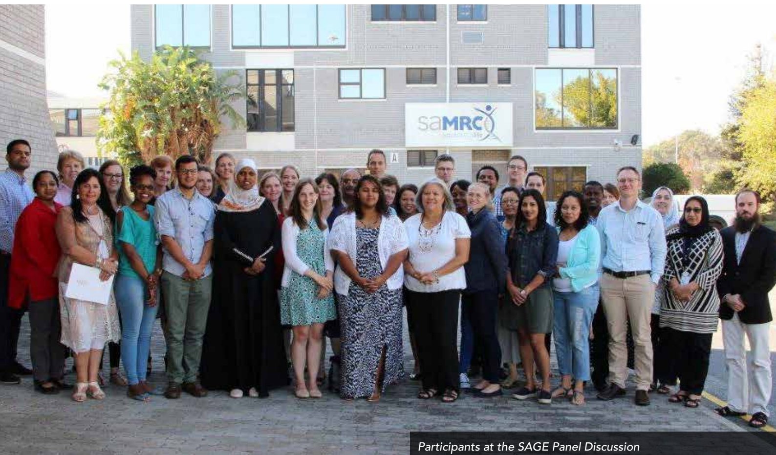
Participants at the SAGE Panel Discussion