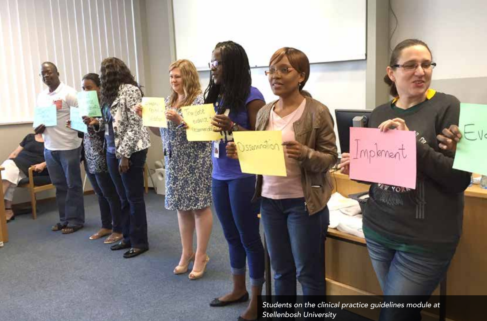
Students on the clinical practice guidelines module at Stellenbosch University